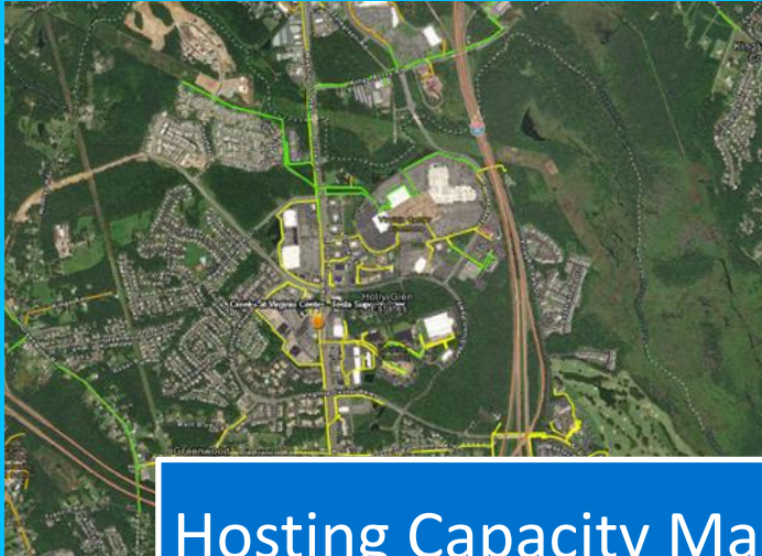
Hosting Capacity Map