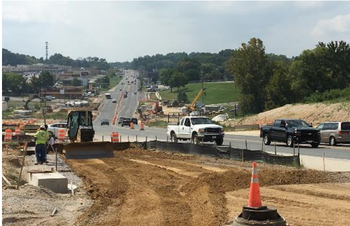
NVTA has funded multiple projects to widen and improve Route 1 in Northern Virginia.

Lead region in planning and advocating for emerging transportation technologies which address future transportation, workplace and development trends.