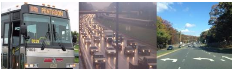
Across the region, NVTA is focused on multimodal transportation solutions.

Support transportation infrastructure development through excellent stewardship of tax payer dollars, maximizing opportunities from existing sources, and advocating for additional transportation revenues.