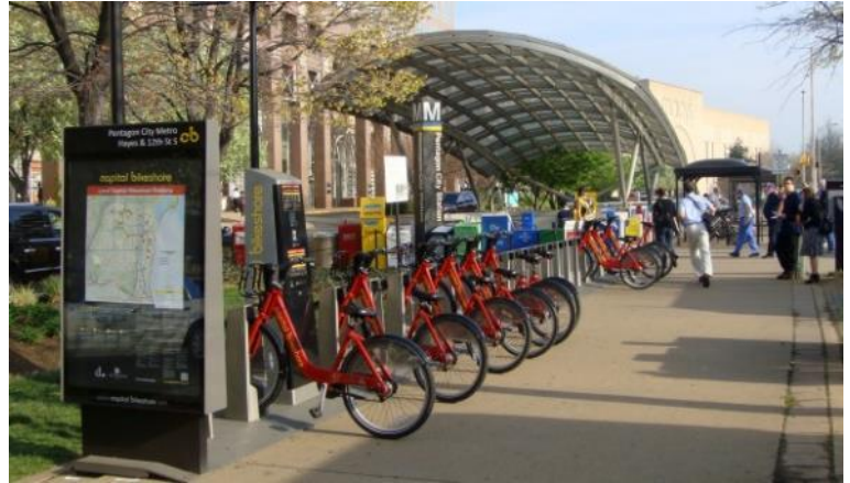
NVTA works with several transit agencies across Northern Virginia including, VRE, WMATA, NVTC, DRPT and PRTC.

Multimodal regional transportation planning and programming are the foundation for making sound investments. The mobility goal of the Authority focuses on its core activity of multimodal regional transportation planning and the programming of investments in regional projects. The Authority will develop and regularly update TransAction and the Six Year Program through public engagement and a data driven process. The Authority will also refine the principles of long-term benefits into implementable practices. Collaboration with member jurisdictions and agencies will be necessary for planning and programming that increase connectivity and improve regional mobility. In addition, the Authority will boost communications with target audiences to increase awareness of the Authority's impact on regional mobility.