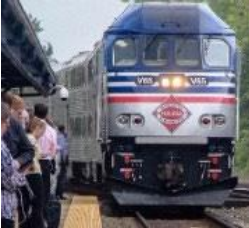
The NVTA's policies and priorities are guided by two aspirations: reduce congestion and move the greatest number of people in the most cost-effective manner.

Foster regional prosperity by investing in a sustainable transportation network that supports economic growth, while balancing quality of life.