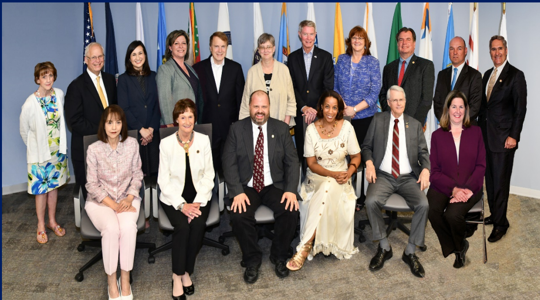
2018 Members of the Northern Virginia Transportation Authority