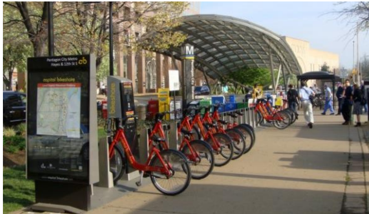
NVTA works with several transit agencies across Northern Virginia including, VRE, WMATA, NVTC, DRPT and PRTC.

Multimodal regional transportation planning and programming are the foundation for making sound investments. The mobility goal of the Authority focuses on its core activity of multimodal regional transportation planning and the programming of investments in regional projects. The Authority will develop and regularly update TransAction and the Six Year Program through public engagement and a data driven process. The Authority will also refine the principles of long term benefits into implementable practices. Collaboration with member jurisdictions and agencies will be necessary for planning and programming that increase connectivity and improve regional mobility. In addition, the Authority will boost communications with target audiences to increase awareness of the Authority's impact on regional mobility.