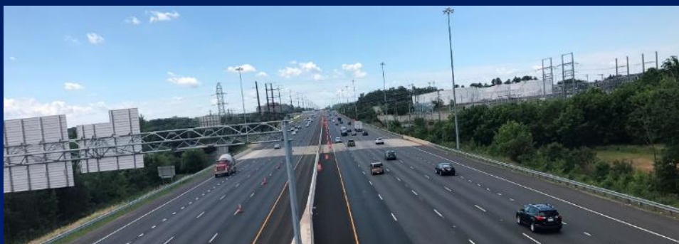
NVTa celebrated the completion of several road widening projects along Route 28 in October 2017.