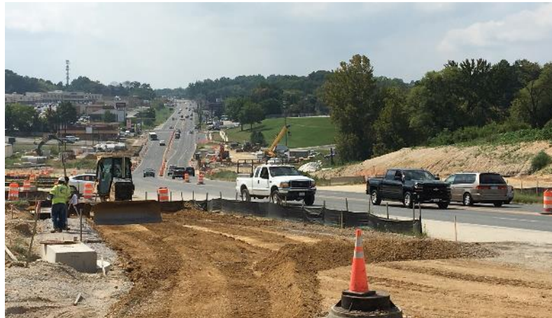
NVTA has funded multiple projects to widen and improve Route 1 in Northern Virginia.

While 'disruptive' technologies are creating uncertainty in the future of transportation, the Authority's readiness to innovate in anticipation of emerging transportation technologies and related trends is crucial to investing in the best transportation solutions. Examples of innovative opportunities include encouragement of shared mobility and/or vehicle ownership, incentivized travel behaviors, and new approaches to addressing 'first/last mile' challenges. The Authority will focus on proactively analyzing and identifying emerging innovative technologies for robust solutions. Undertaking these initiatives will make the region a leader as the future of transportation preferences, and living and working conditions transform. The Authority will also increase collaboration and communication with the state and key stakeholders to create an ongoing dialogue regarding emerging transportation technologies and the Authority's innovations to achieve its Vision.