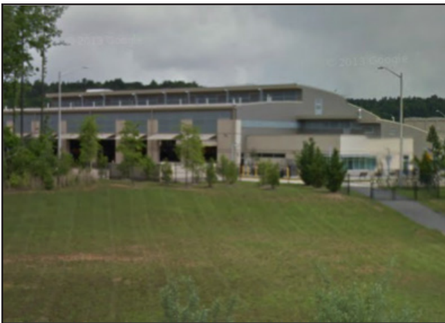
Existing West Ox Bus Garage, looking North