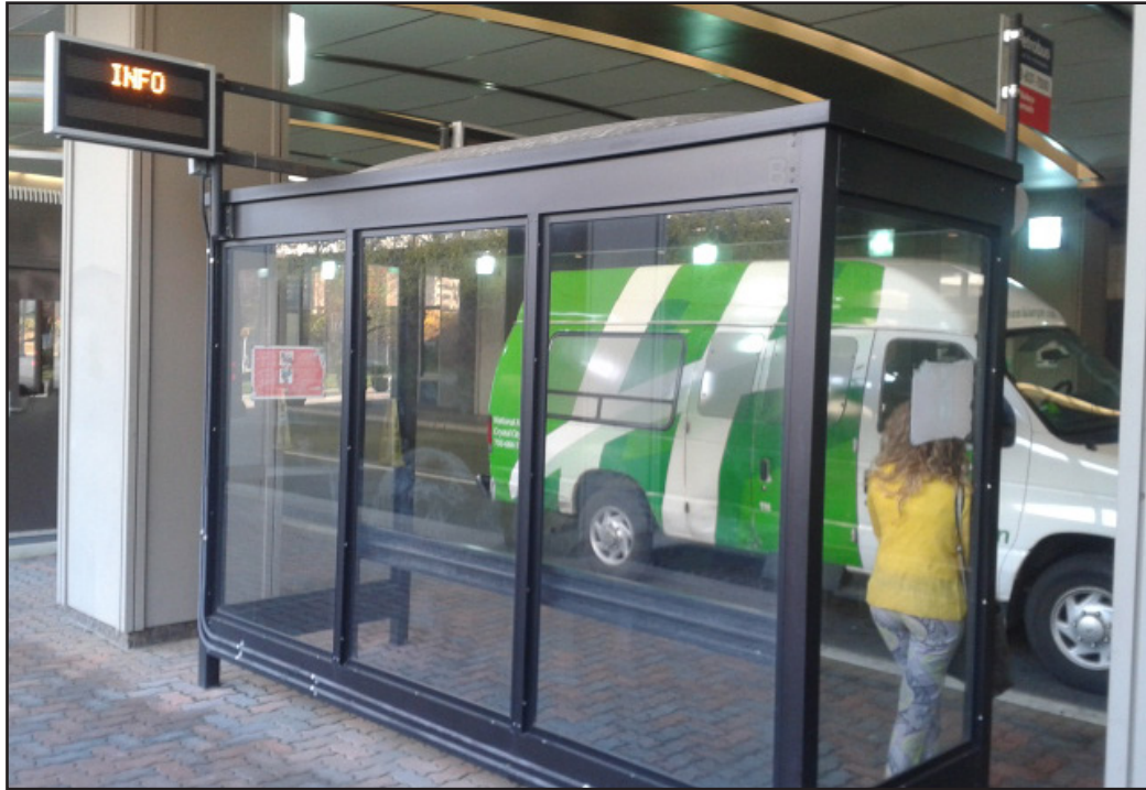
Shuttles Backing up into Metrobus Bays on South Bell Street