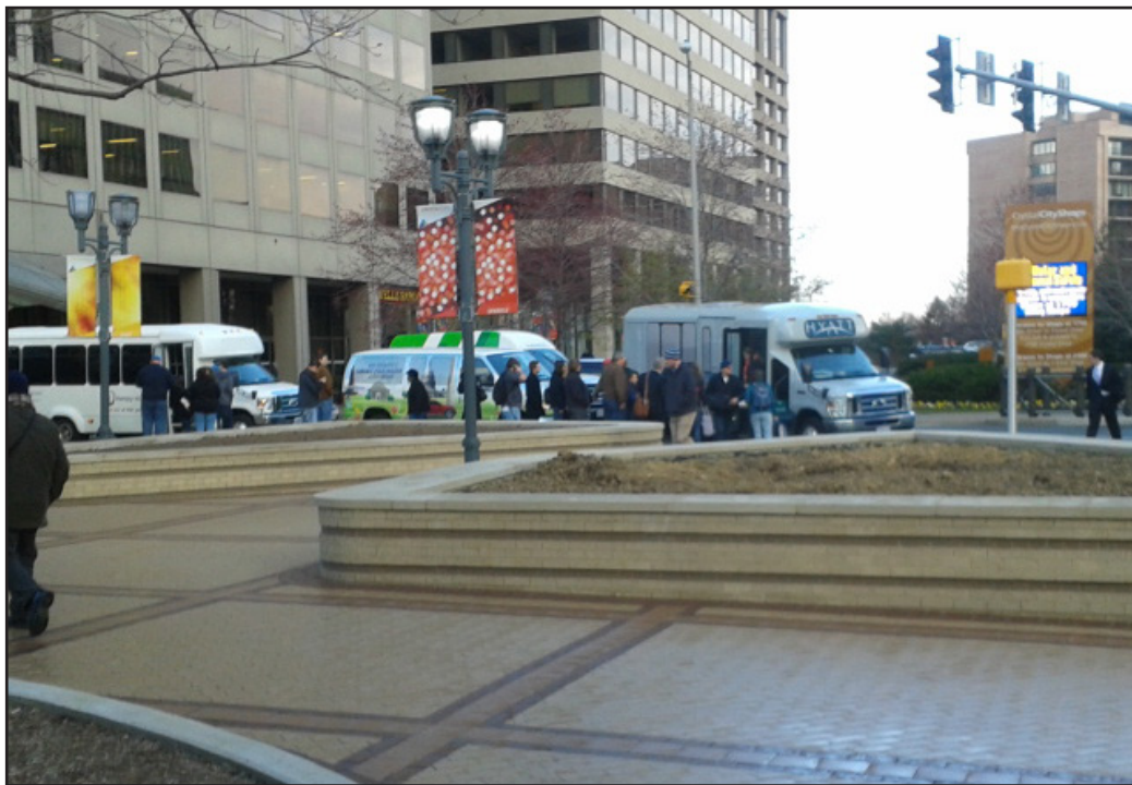
Shuttle Congestion in Right Turn Lane by Metrorail