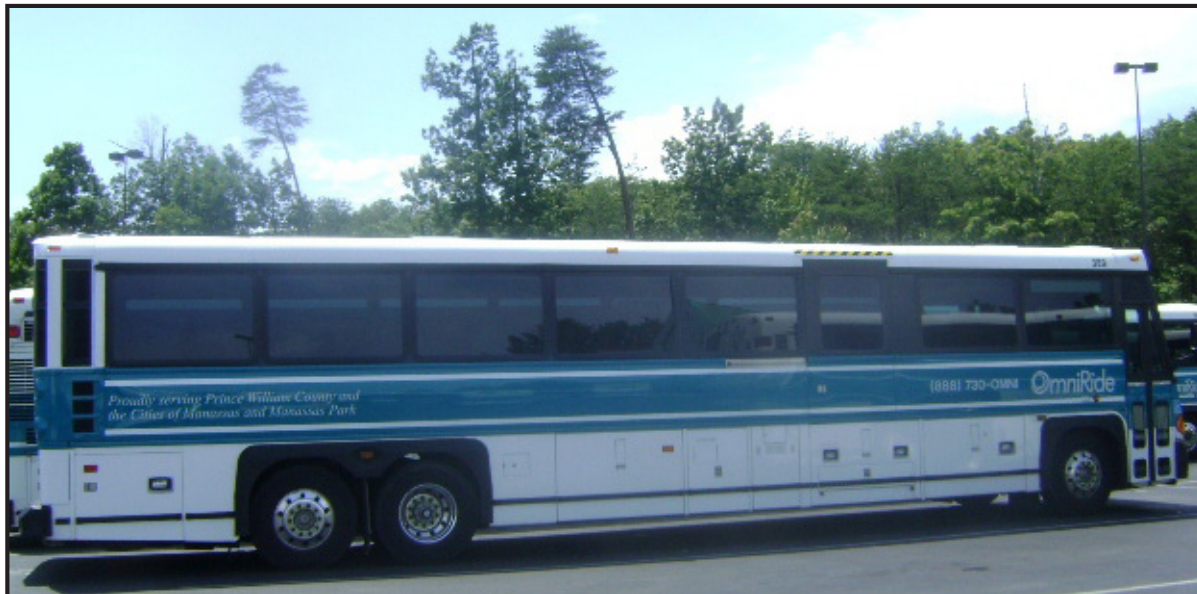
Picture of MCI 45-ft commuter bus similar to the bus that will be used to support new Gainesville service