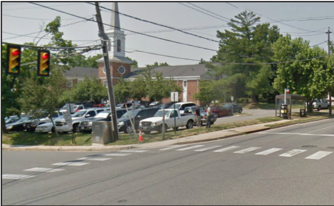
Figure 1: Existing Intersection Lacks Pedestrian Signals