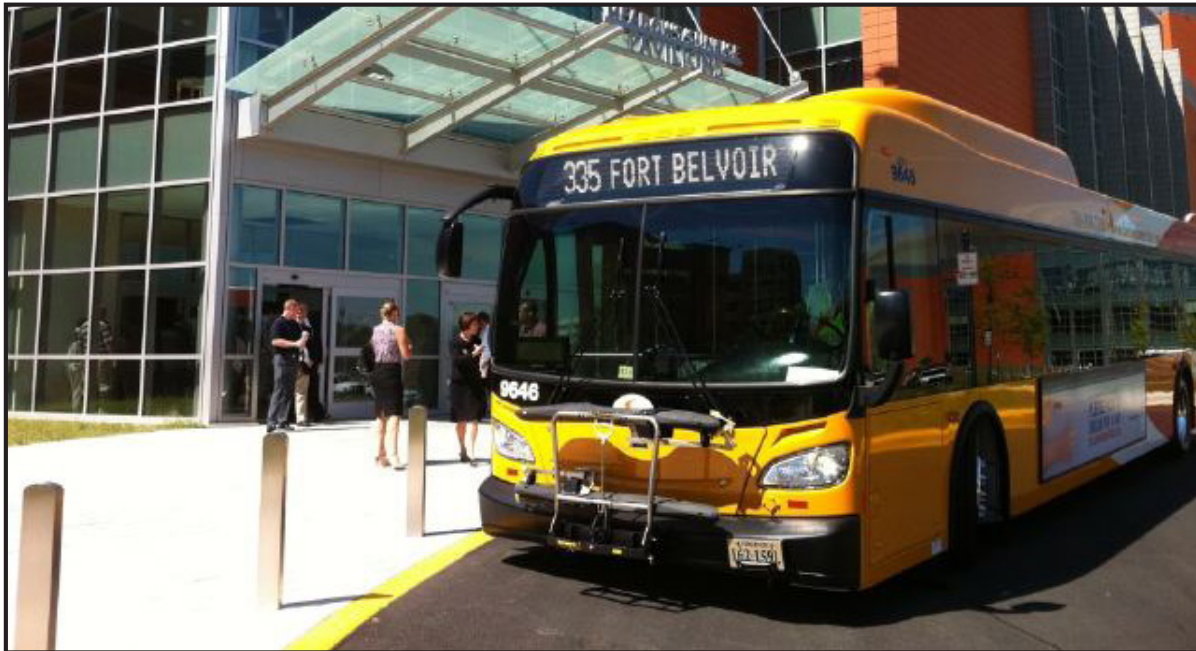
Fairfax County Connector Bus