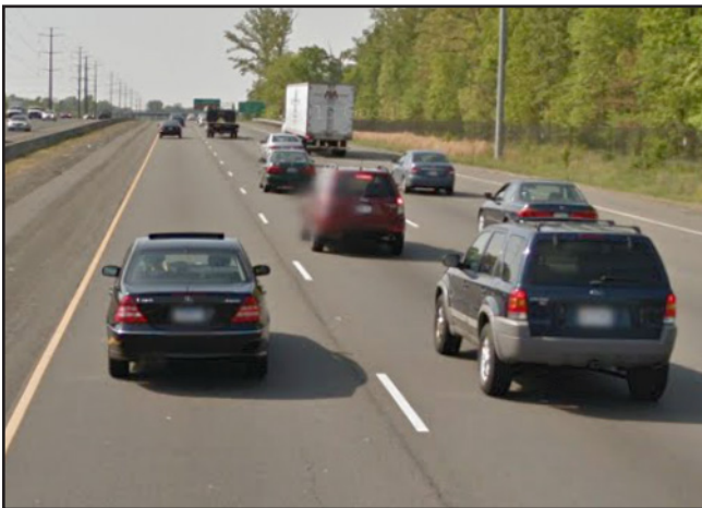
Route 28 Southbound Approaching Route 50