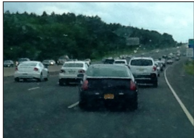
Route 28 Southbound Air & Space Museum Parkway