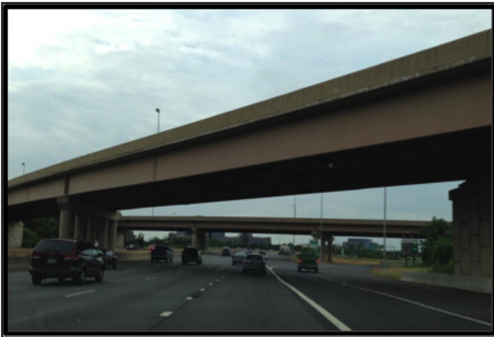
A 4 th Lane will provide added capacity and eliminate a lane drop in a critical section of Route 28