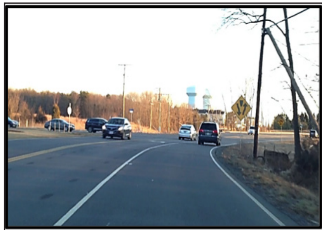
Belmont Ridge Road, South of the Dulles Greenway