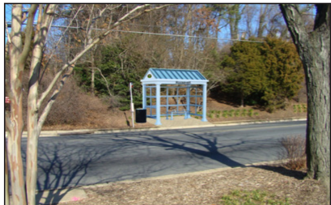
Figure 2: Example Stop with Proposed Shelter