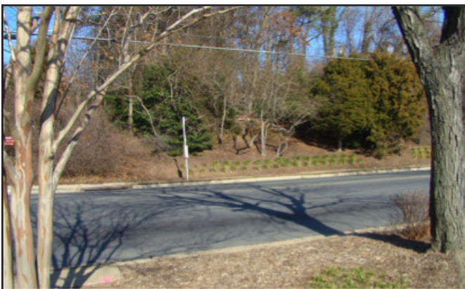
Figure 1: Example Existing Stop without Shelter