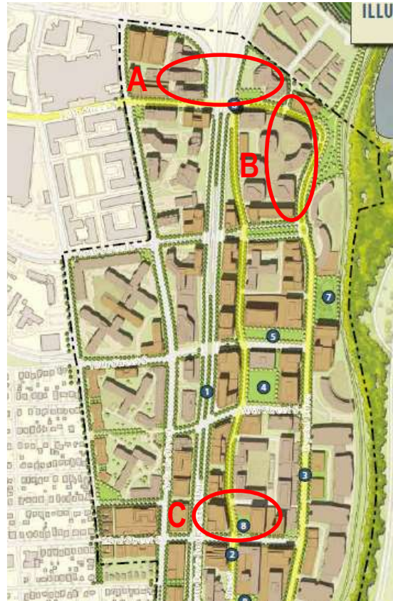
Project Location in relation to existing conditions and the Crystal City Sector Plan (adopted 2010).