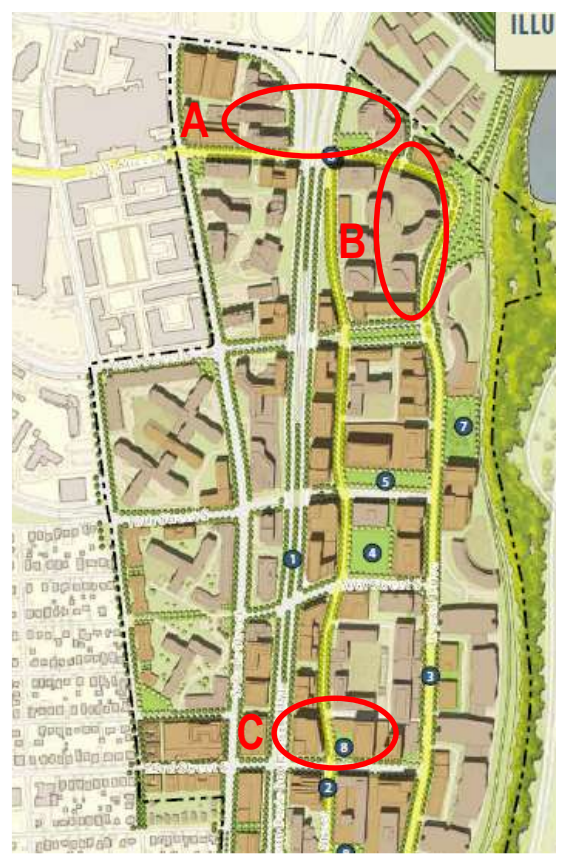
Project Location in relation to existing conditions and the Crystal City Sector Plan (adopted 2010).