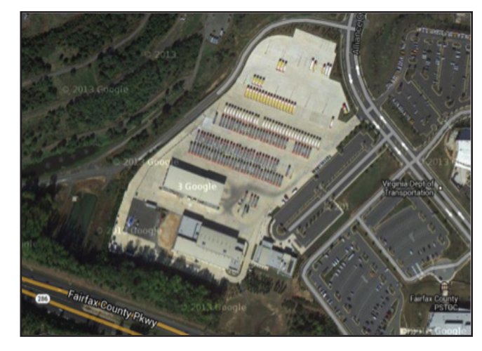
Existing West Ox Bus Garage and Connector Buses