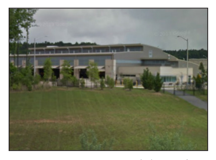
Existing West Ox Bus Garage, looking North