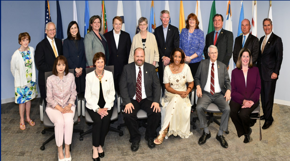
2018 Members of the Northern Virginia Transportation Authority