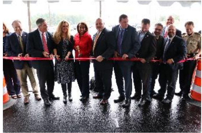
NVTA celebrated the completion of a new intersection along Loudoun County Parkway in September 2017.

Transparency, stewardship and accountability are the Authority's core values for funding, which exhibit the importance of regionalism leading to responsive transportation solutions. Funding is the foundation from which the Authority has the ability to understand, coordinate, plan and deliver multimodal regional transportation solutions. In an effort to enhance the Authority's fiscal strength and increase awareness of the Authority's role in funding multimodal regional projects, the Authority will identify opportunities with key stakeholders and agencies to advance the recognition of the Authority's role in funding transportation infrastructure.