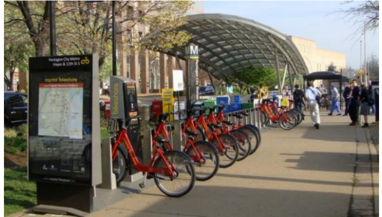
NVTA works with several transit agencies across Northern Virginia including, VRE, WMATA, NVTC, DRPT and PRTC.

Multimodal regional transportation planning and programming are the foundation for making sound investments. The mobility goal of the Authority focuses on its core activity of multimodal regional transportation planning and the programming of investments in regional projects. The Authority will develop and regularly update TransAction and the Six Year Program through public engagement and a data driven process. The Authority will also refine the principles of long term benefits into implementable practices. Collaboration with member jurisdictions and agencies will be necessary for planning and programming that increase connectivity and improve regional mobility. In addition, the Authority will boost communications with target audiences to increase awareness of the Authority's impact on regional mobility.