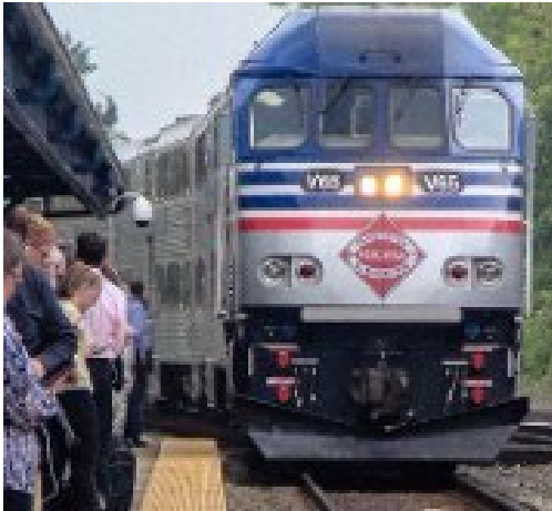
The NVTA's policies and priorities are guided by two aspirations: reduce congestion and move the greatest number of people in the most cost-effective manner.

Foster regional prosperity by investing in a sustainable transportation network that supports economic growth, while balancing quality of life.