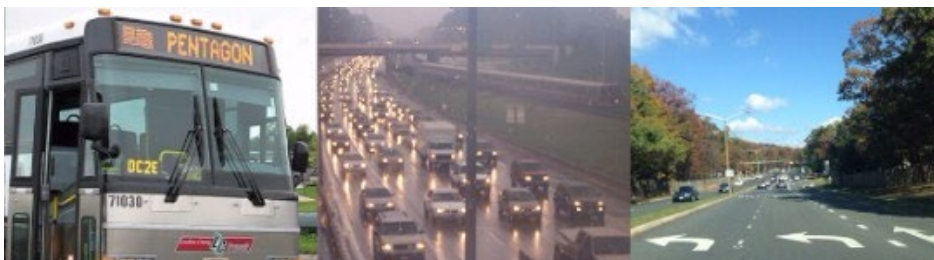
Across the region, NVTA is focused on multimodal transportation solutions.

Support transportation infrastructure development through excellent stewardship of tax payer dollars, maximizing opportunities from existing sources, and advocating for additional transportation revenues.