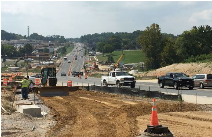
NVTA has funded multiple projects to widen and improve Route 1 in Northern Virginia.

Lead region in planning and advocating for emerging transportation technologies which address future transportation, workplace and development trends.