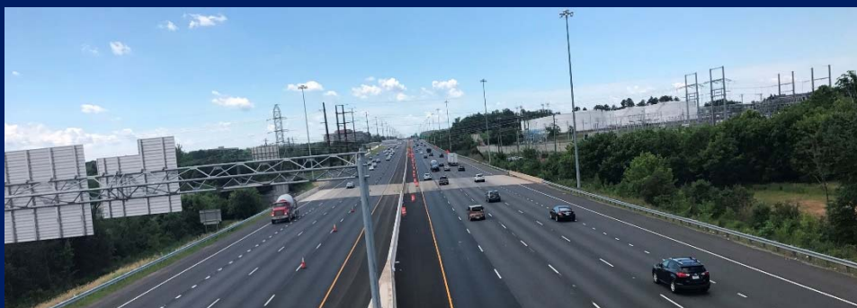
NVTA celebrated the completion of several road widening projects along Route 28 in October 2017.