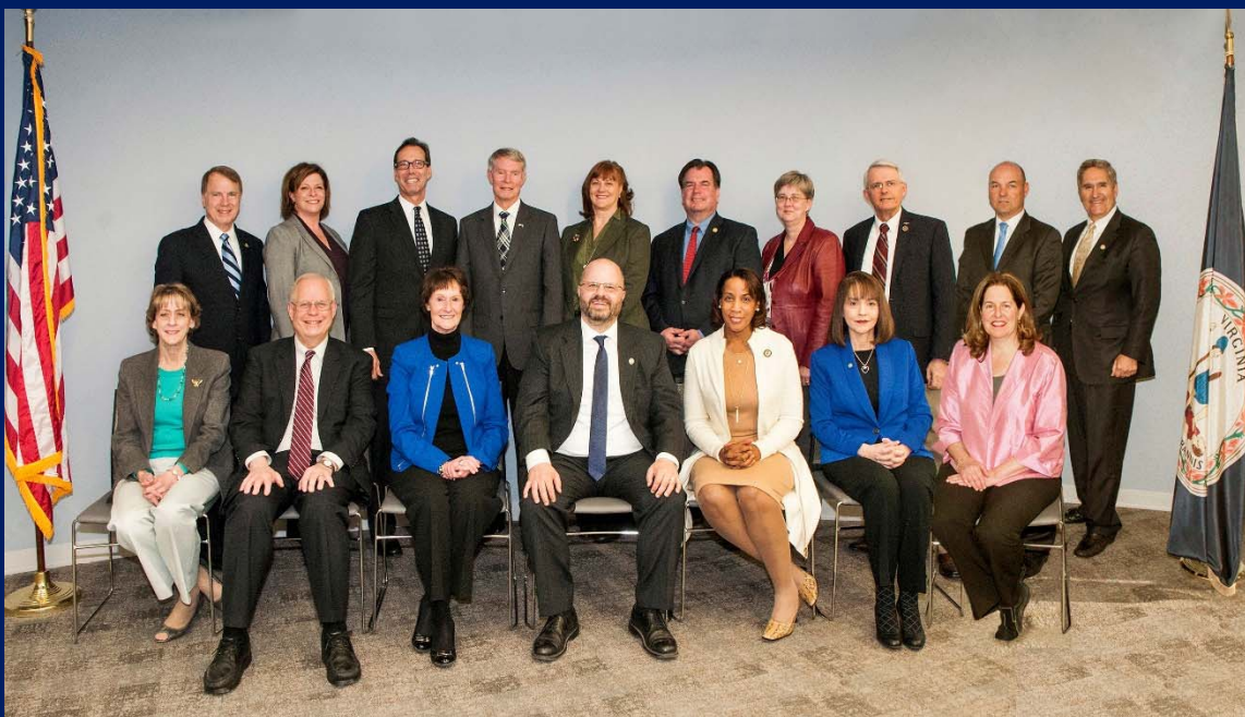
2017 – Members of the Northern Virginia Transportation Authority