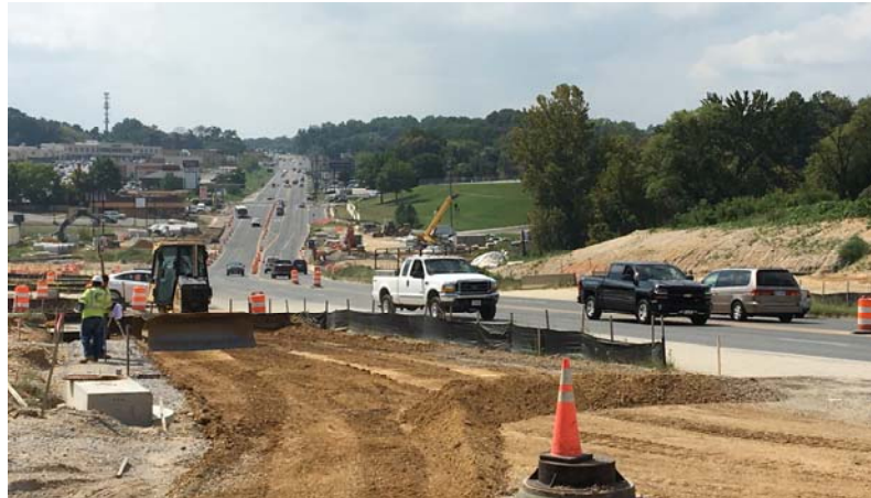
NVTA has funded multiple projects to widen and improve Route 1 in Northern Virginia.

While ‘disruptive’ technologies are creating uncertainty in the future of transportation, the Authority’s readiness to innovate in anticipation of emerging transportation technologies and related trends is crucial to investing in the best transportation solutions. Examples of innovative opportunities include encouragement of shared mobility and/or vehicle ownership, incentivized travel behaviors, and new approaches to addressing ‘first/last mile’ challenges. The Authority will focus on proactively analyzing and identifying emerging innovative technologies for robust solutions. Undertaking these initiatives will make the region a leader as the future of transportation preferences, and living and working conditions transform. The Authority will also increase collaboration and communication with the state and key stakeholders to create an ongoing dialogue regarding emerging transportation technologies and the Authority’s innovations to achieve its Vision.