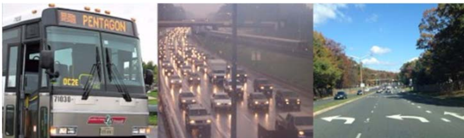
Across the region, NVTA is focused on multimodal transportation solutions.