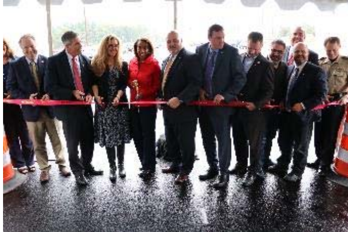
NVTA celebrated the completion of a new intersection along Loudoun County Parkway in September 2017.

Transparency, stewardship and accountability are the Authority's core values for funding, which exhibit the importance of regionalism leading to responsive transportation solutions. Funding is the foundation from which the Authority has the ability to understand, coordinate, plan and deliver multimodal regional transportation solutions. In an effort to enhance the Authority's fiscal strength and increase awareness of the Authority's role in funding multimodal regional projects, the Authority will identify opportunities with key stakeholders and agencies to advance the recognition of the Authority's role in funding transportation infrastructure.