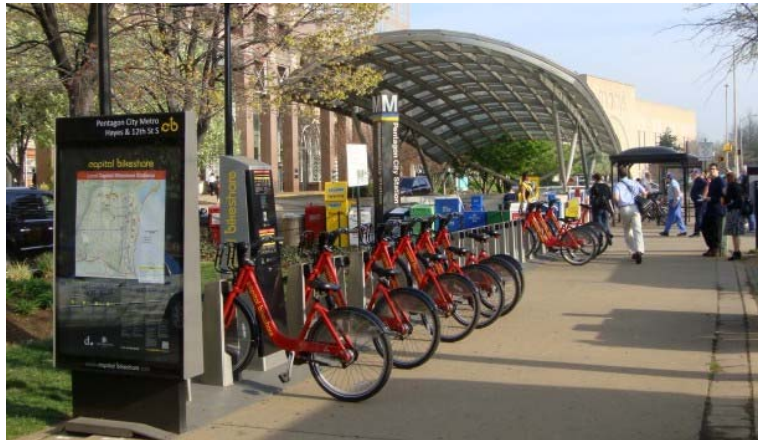
NVTA works with several transit agencies across Northern Virginia including, VRE, WMATA, NVTC, DRPT and PRTC.

Multimodal regional transportation planning and programming are the foundation for making sound investments. The mobility goal of the Authority focuses on its core activity of multimodal regional transportation planning and the programming of investments in regional projects. The Authority will develop and regularly update TransAction and the Six Year Program through public engagement and a data driven process. The Authority will also refine the principles of long term benefits into implementable practices. Collaboration with member jurisdictions and agencies will be necessary for planning and programming that increase connectivity and improve regional mobility. In addition, the Authority will boost communications with target audiences to increase awareness of the Authority's impact on regional mobility.