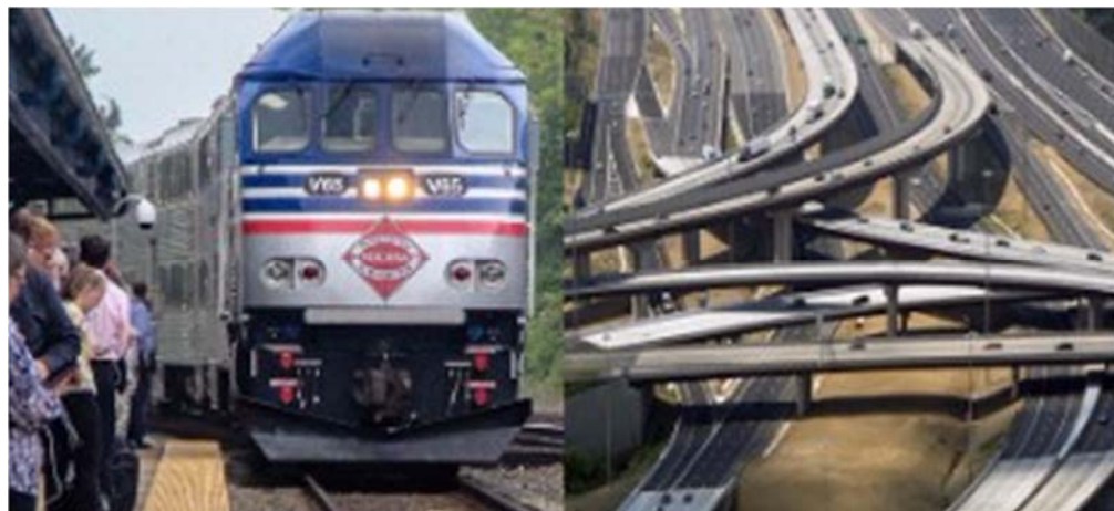
The NVTa's policies and priorities are guided by two overarching goals: reduce congestion and move the greatest number of people in the most cost-effective manner.

Economic growth and transportation are integrally linked, as are traffic congestion and quality of life. The Authority's robust transportation plans and investments support continued regional prosperity and improve multimodal transportation options in Northern Virginia. While the Authority has an established reputation for creating a transportation network that sustains economic growth, there are ways in which the Authority can make a bigger impact. To date, the Authority has conducted research and a public survey to better understand how the Northern Virginia transportation network impacts economic growth and quality of life. The Authority can enhance communications with key audiences regarding the economic and quality of life impacts of its multimodal transportation investments.