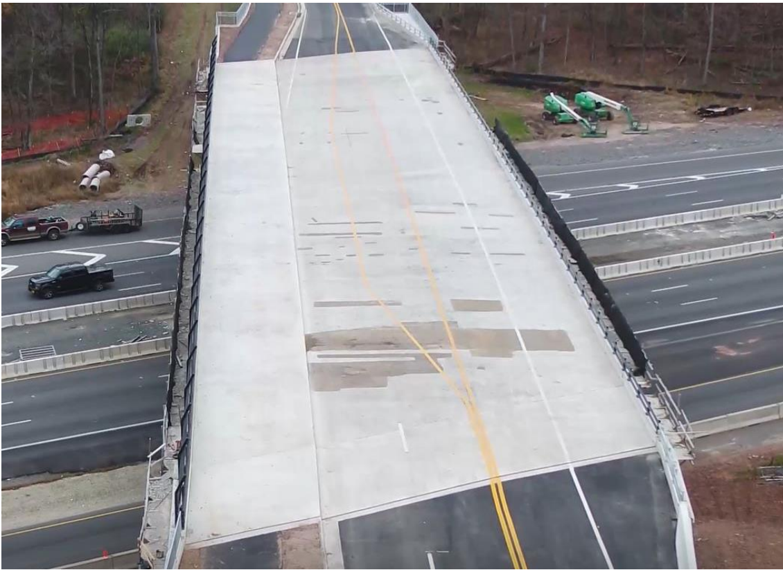
A new Poplar Tree Road Bridge over Route 28 opened in late November 2020. The new bridge includes a shared-use path connecting to the new E.C. Lawrence Park access road, and connections on both sides of Route 28.