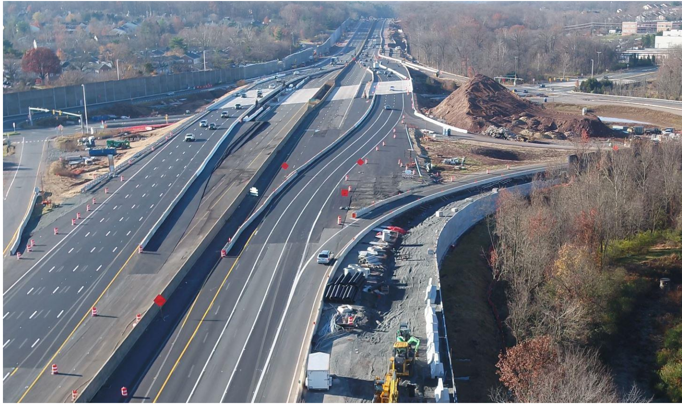
New I-66 Bridges over Route 29 Centreville are being lengthened, widened, and raised for the new I-66 Express Lanes and to provide room for any future mass transit along I-66 and future widening of Route 29.