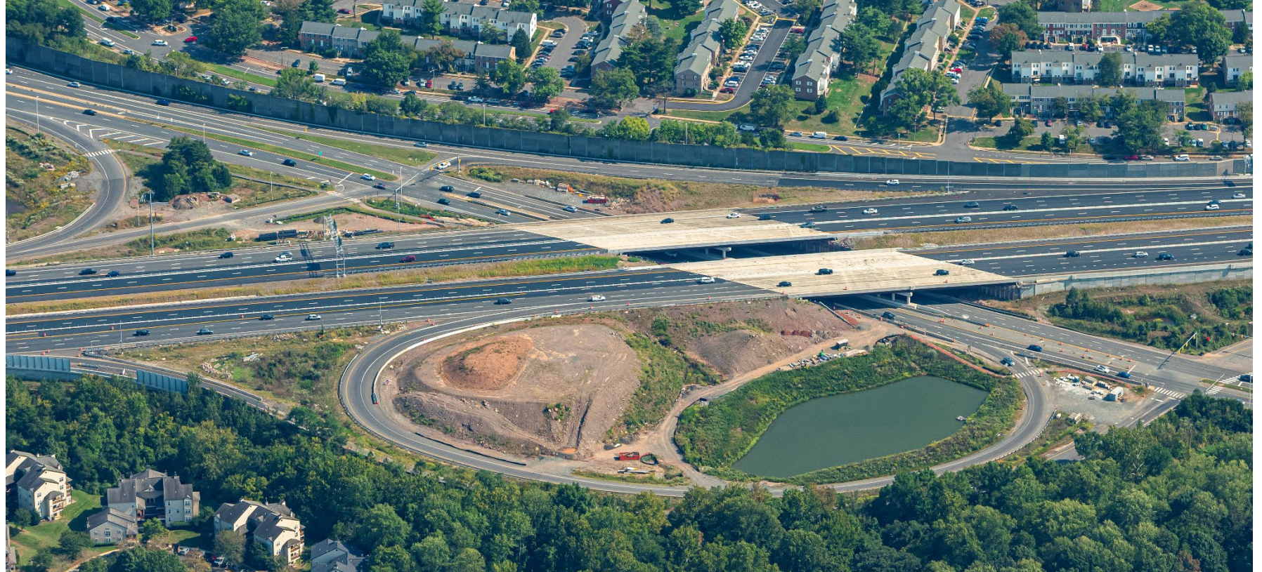
September 2022, Route 29 Interchange

New I-66 Bridges over Route 29 Centreville are being lengthened, widened, and raised for the new I-66 Express Lanes and to provide room for any future mass transit along I-66 and future widening of Route 29.