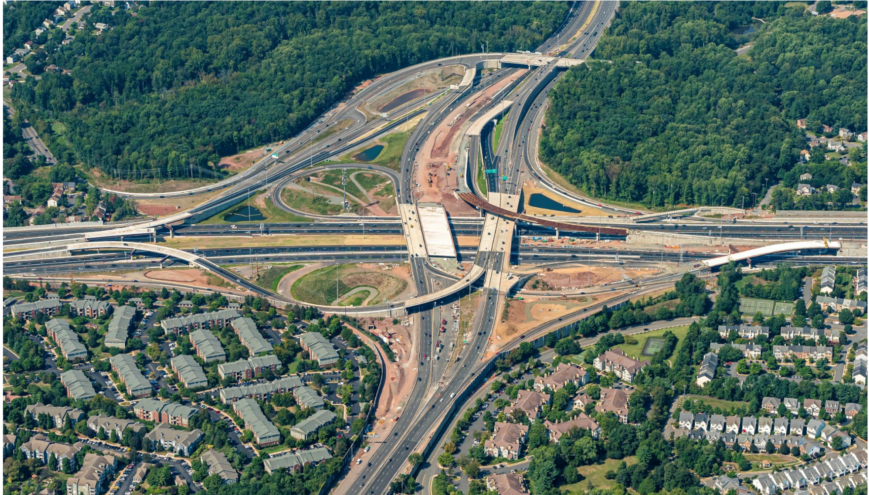
September 2022, Route 28 Interchange

The Route 28 Interchange at I-66 continues to take shape, with new ramps and connections added as construction advances.